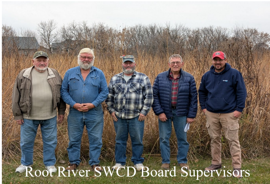
Root River SWCD Board Supervisors